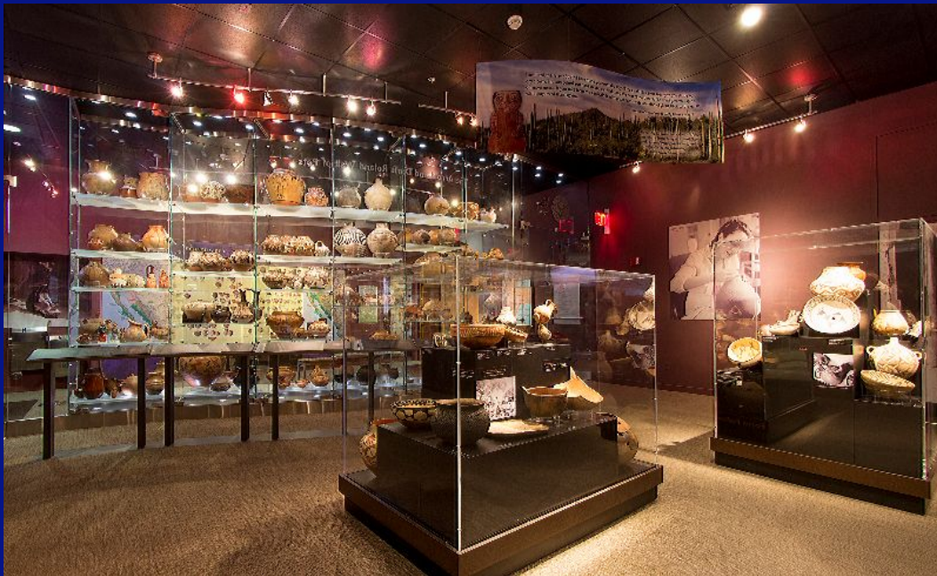
View of the Arnold and Doris Roland Wall of Pots, Arizona State Museum, University of Arizona

Member Program - Tour Behind the Scenes at the Arizona State Museum