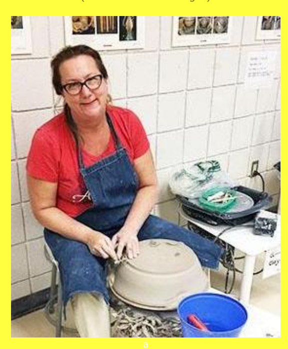
For more Class information & to register online! <a href="https://www.pima.gov/nrpr">www.pima.gov/nrpr</a>