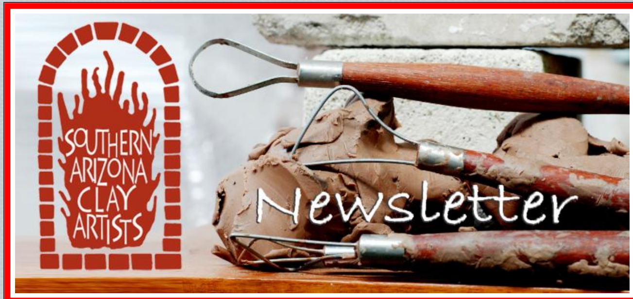
Table of Contents for SACA June 2017 Newsletter (just click on topic desired!)