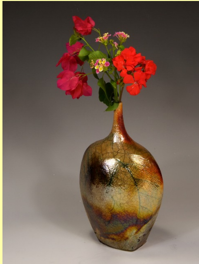
"Raku in Spring" featured in the "Pots with Flowers" of ICAN Calendar/February

NOTE: Check out Janet's New Classes too!