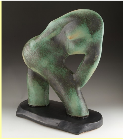
"Stretch" featured in the "Sculpture Collection/July" of ICAN Calendars!