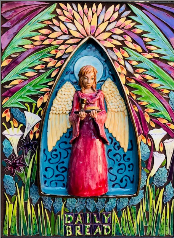
Daily Bread 24" x 18" Ceramic Shadow Box