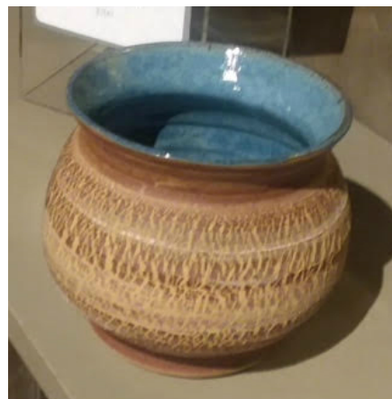
"Desert Canyon III" by Dan Granger.