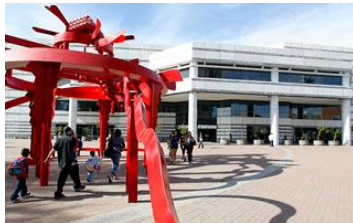
Joel D. Valdez Main Pima County Library

There will be an art display/show at the Main Pima County Library show downtown in the month of December.