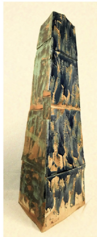
'Tree in Sh 40x14x12", stoneware

January 6-February 17, 2024 Opening reception January 6th,